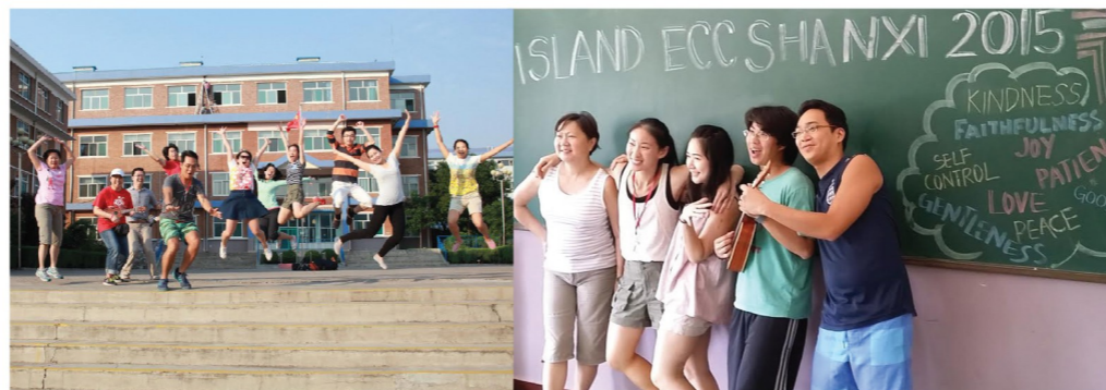
Mission Trip to Shanxi

You can tell God you accept Him now. "Father, I believe you love me. You gave your one and only Son so I can live forever with you. Apart from you, I die. With you, I live. I choose life. I choose you."