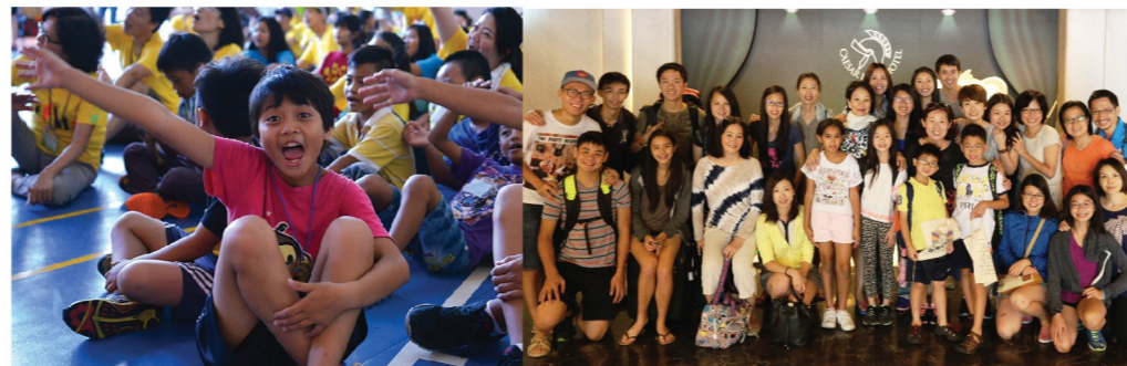
Mission Trip to Taiwan

"Father, I believe you love me. You gave your one and only Son so I can live forever with you. Apart from you, I die. With you, I live. I choose life. I choose you."